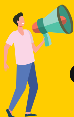
TABLE OF SOLUTIONS